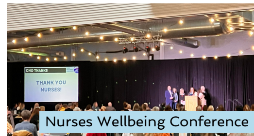
Nurses Wellbeing Conference